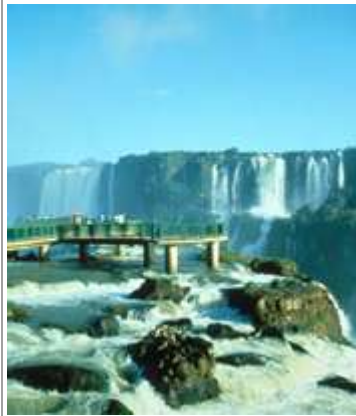
Viewing Iguazu Falls from the Brazilian side