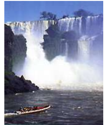
Get up close to Iguassu Falls