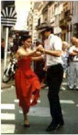
"Tangomania" Argentine tango dancers in the streets of Buenos Aires