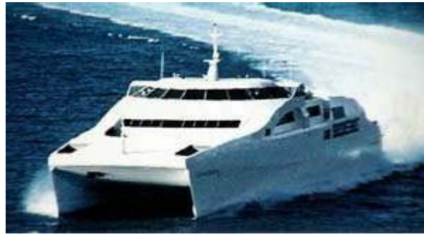
Take a high-speed Catamaran to Colonia, Uruguay