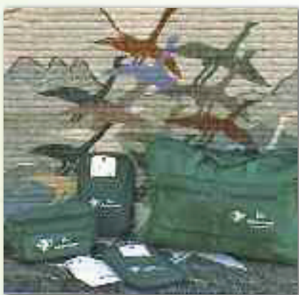
EcoAdventures' Final Documents Kit